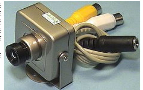
Metallikoteloisia minikameroita. Sekä musta-valko, että väri. Ääniluostulolla.